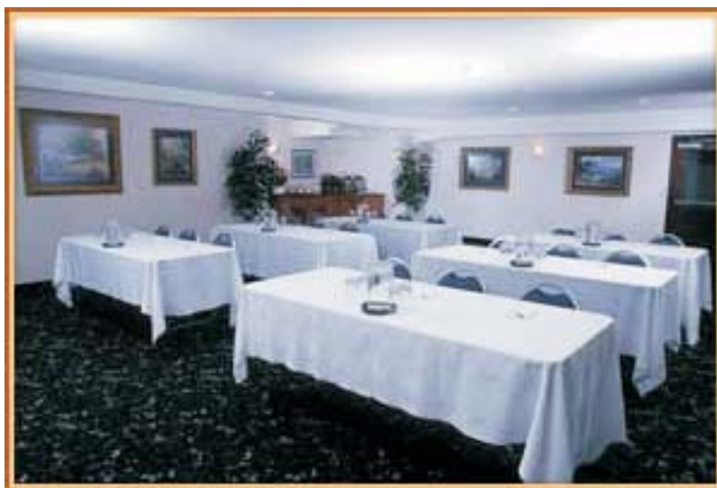
Here is the meeting room at the Salbasgeon!